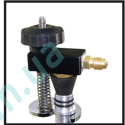
#6 Universal couplers