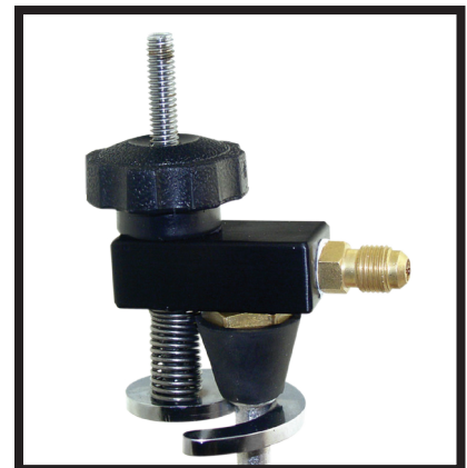
#12 Universal couplers