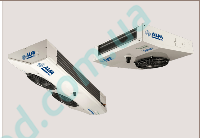
Optigo CS200 (top) and CS300

Design pressure 40 bar (HFO/HFC, model CSE) or 80 bar (CO 2 , model CSX). Each heat exchanger is leak tested with dry air and finally supplied with a nitrogen pre-charge.